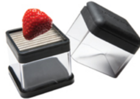
Place food on blades