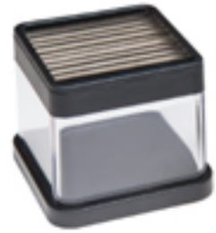
Set base with blades facing up on the counter