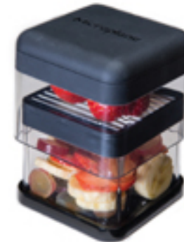
Place cover over food and push down firmly to slice